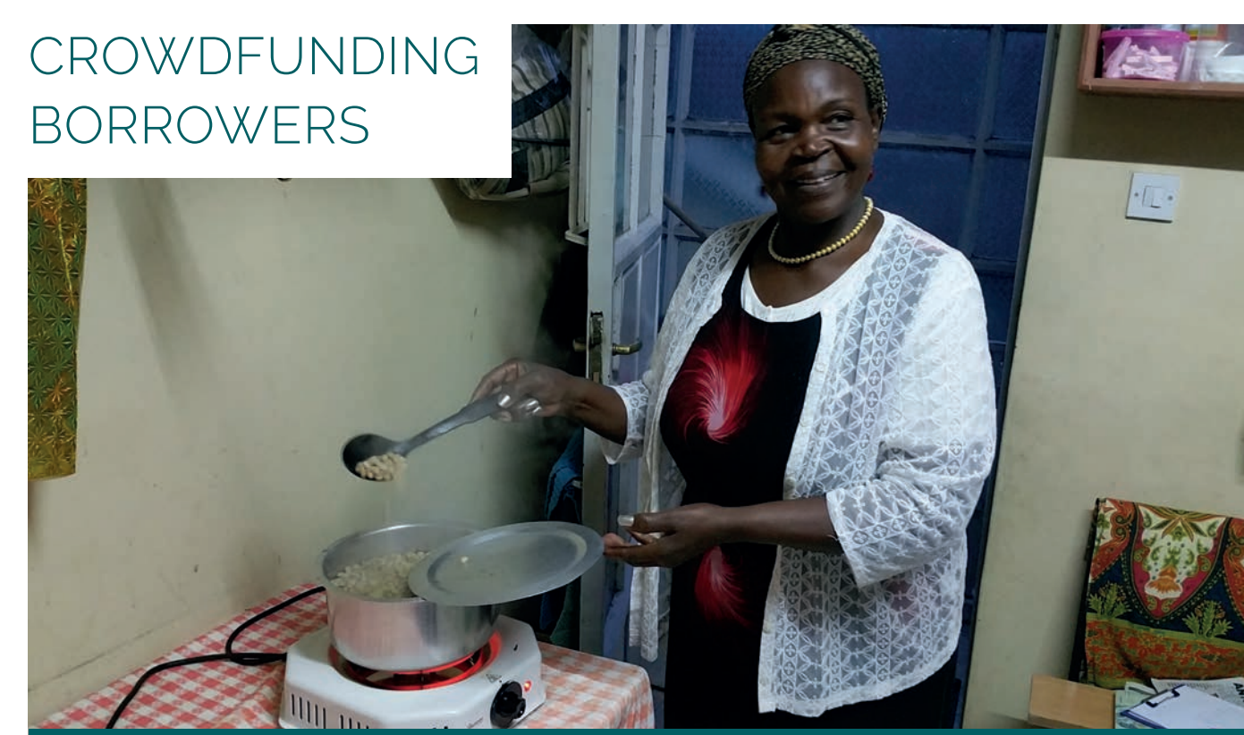
Companies should assess their own funding needs and stage of maturity when choosing a crowdfunding platform