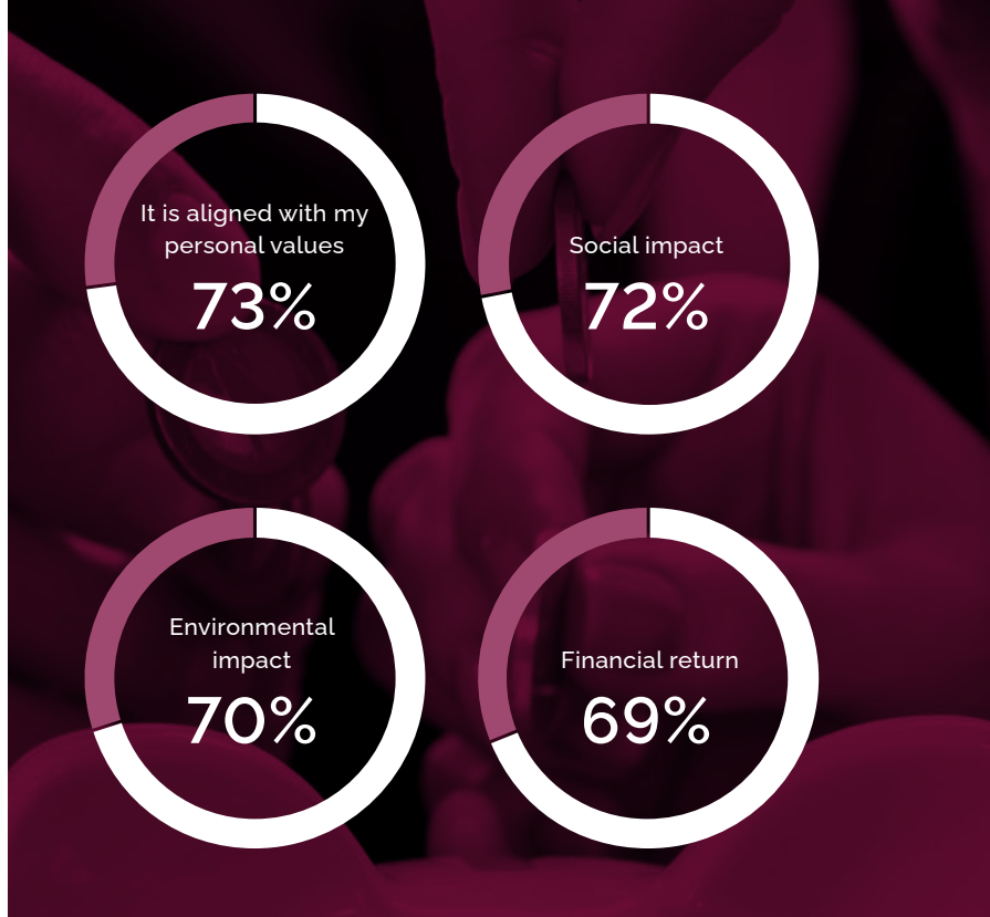
Figure 2: Primary Motivations for Crowd Investing on P2P Micro-lending Platforms